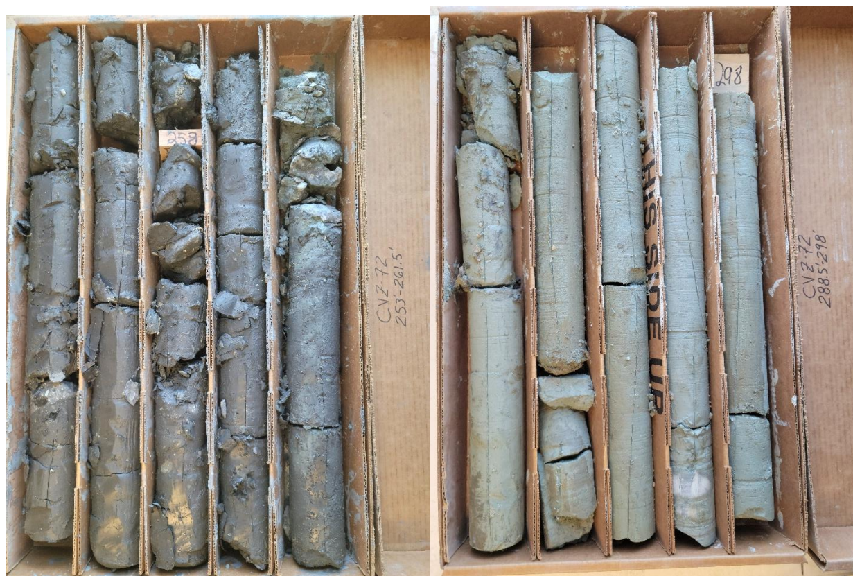
Figure 1 – Two boxes of core from CVZ-72. The box on the left is from depths of 253-261.5ft (77.1-79.7m) and shows some of the black, highly reduced mudstone/claystone. The box on the right is from 288.5-298ft (87.9-90.8m) and is typical of the somewhat less reduced blue mudstone/claystone. From past drilling experience, both lithologic units are usually high in lithium content.